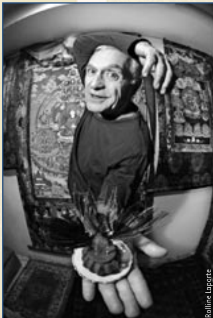
John Giorno, 2007

Generation whose powerful voices, those of Burroughs, Ginsberg and Kerouac among others, caused an upheaval in American culture. In 1965, he created Giorno Poetry Systems , a recording company that would release more than forty vinyl records and CDs of poets and musicians in performance, including John Cage, William S. Burroughs, Allen Ginsberg and Laurie Anderson. • Giorno has been relentless in bringing poetry out of the intimist and elitist mode. Drawn into the orbit of Pop Art, Giorno applied its concepts to poetry. He was part of the group that included Andy Warhol, Lou Reed, Patti Smith and Susan Sontag that Burroughs brought together in his windowless, white-walled "Bunker". Giorno was, in fact, the character sleeping and dreaming for eight hours in Warhol's film Sleep . • Now aged 72, John Giorno is busier than ever and continues to perform around the world. • You can find out more at www.fva.ca