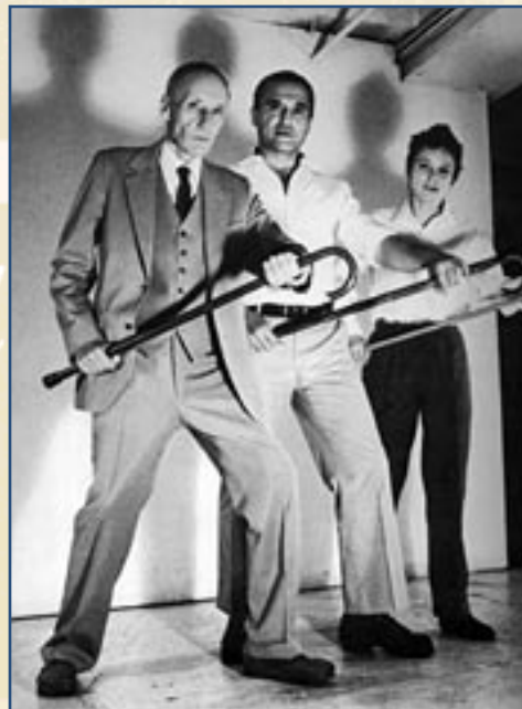
William S Burroughs, John Giorno and Laurie Anderson, a demonic trio, 1981